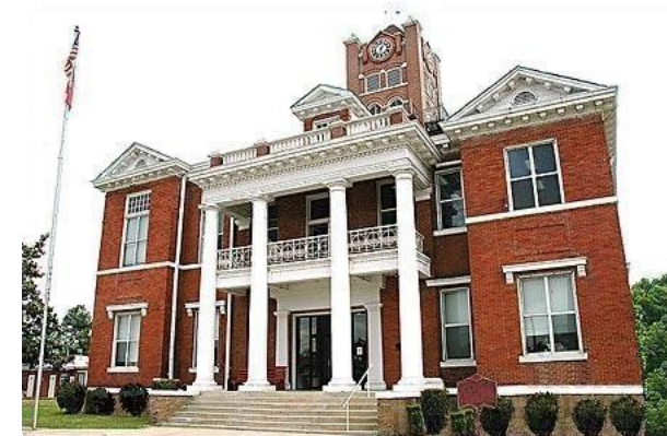
Prairie County Courthouse in Des Arc Opened in 1914