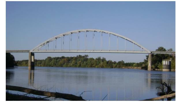
Bridge over the Lower White River at Des Arc Opened in 1970